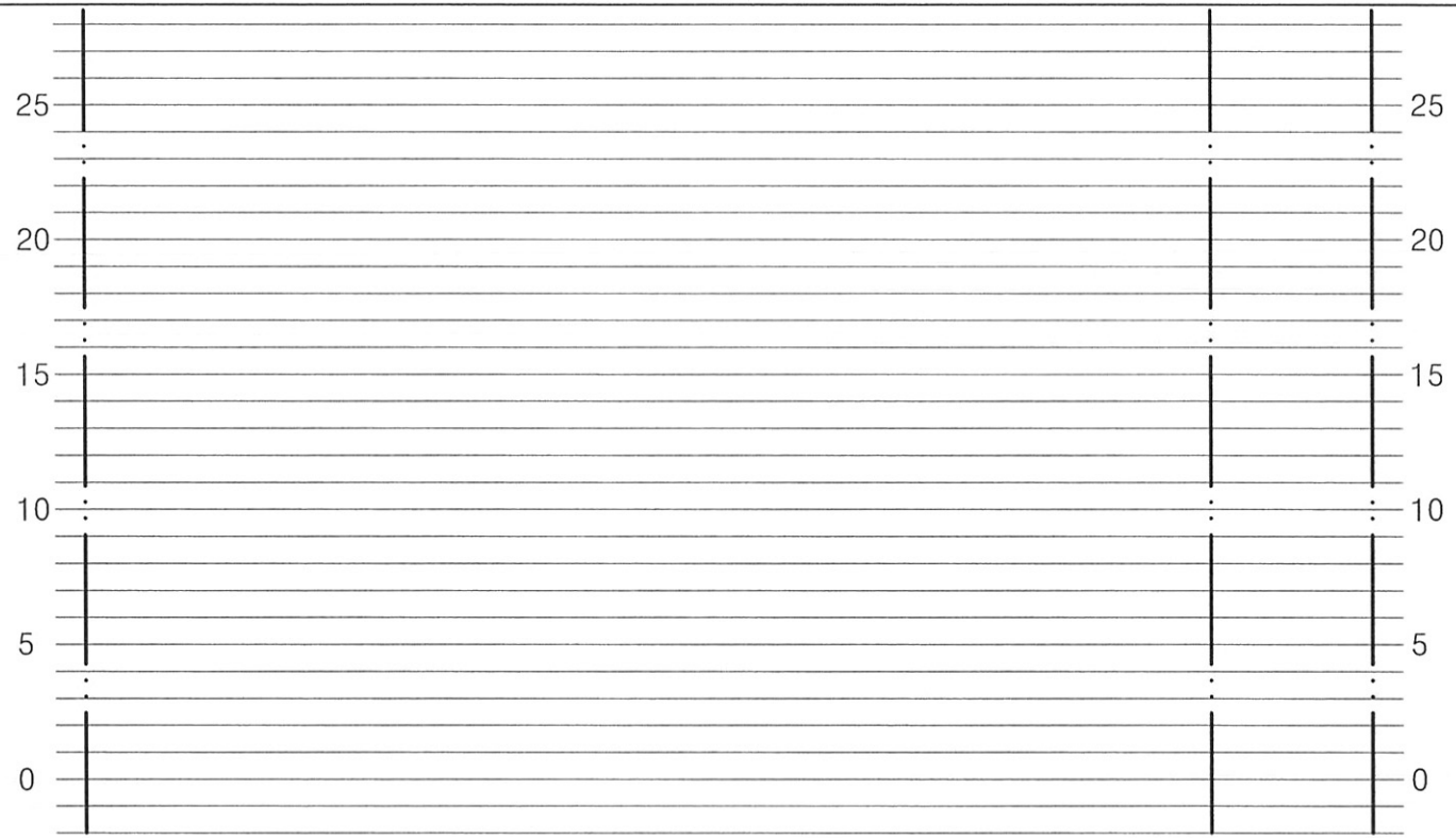
X 단면도 축척 : 1/300